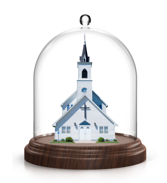
FAMILY RESEARCH COUNCIL Washington, D.C.